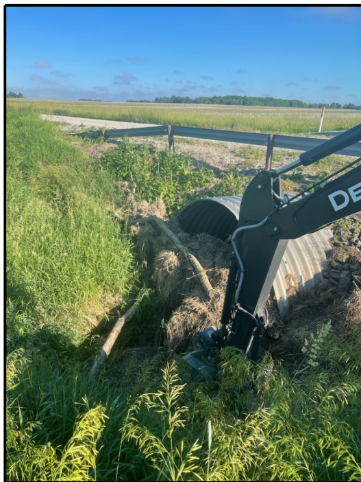
Clearing log jams on Rock Creek channel.