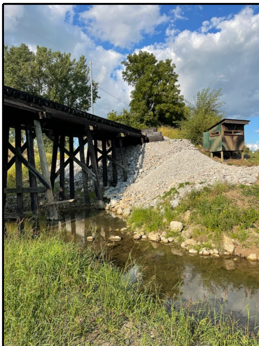
Liberty Center railroad trestle – after.