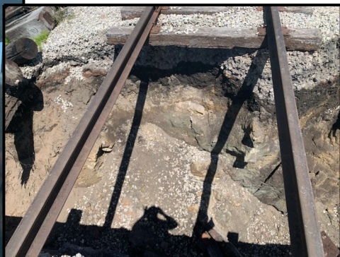
Liberty Center railroad trestle – before.