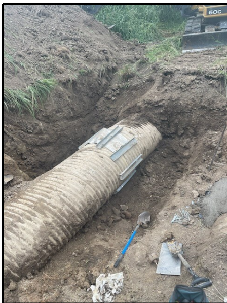
Pipe repair – before and after – East of Hoosier Highway.